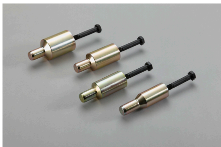
Image 7: 400 0069 10 400 0045 10 400 0110 10 (new) 400 0046 10

This centring tool is designed for models where the diameter of the crankshaft hole (to hold the spigot bearing) is larger than the diameter of the clutch spline and for models without spigot bearing.