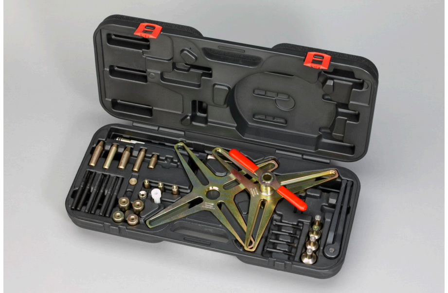
Image 2: 400 0237 10 - The new kit with additional content

The additional tools (see image 3, 5 and 7) can also be purchased individually to add to the previous case.