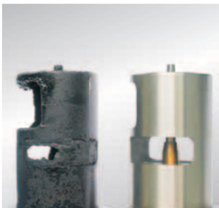
Since EGR valves do not soot themselves, it is essential to search for the causes of soot formation.

A defective component should always be replaced by a new one.