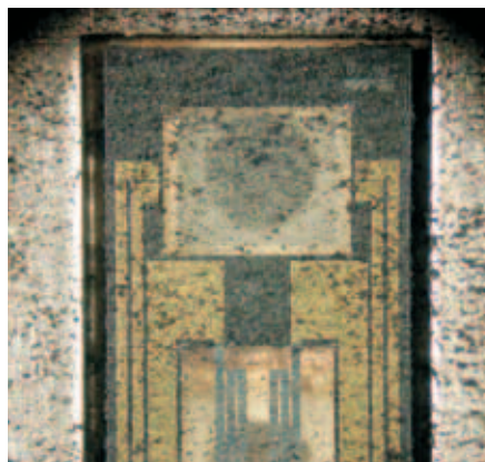
Salt and dirt may damage the sensor of an air mass sensor – they will at least falsify the measurements, which in turn could affect exhaust gas recirculation.