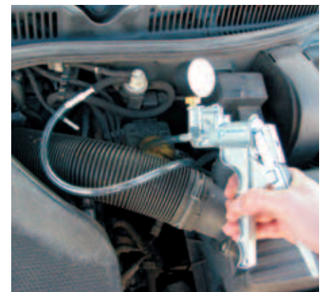
Whether dealing with pneumatic EGR valves or an electro-pneumatic pressure transducer, as in this case: The function can easily be tested using a vacuum hand pump.