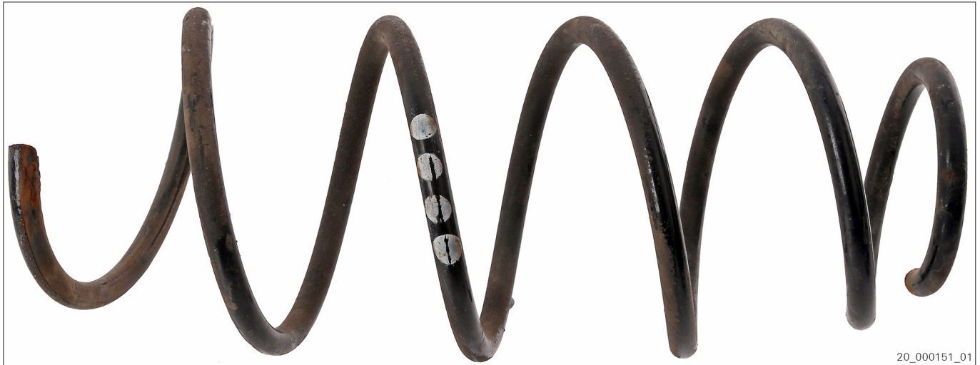
Fig. 2 Used suspension spring with color coding (example)