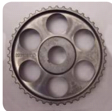
Pic 2: OE #: 023 109 111 D

© SKF is a registered trademark of the SKF Group.