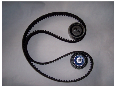
New SKF VKMA 03244 / 03247 content

© SKF is a registered trademark of the SKF Group.