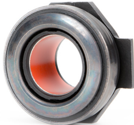
Fig. 3: Release bearings with PTFE housing must not be lubricated