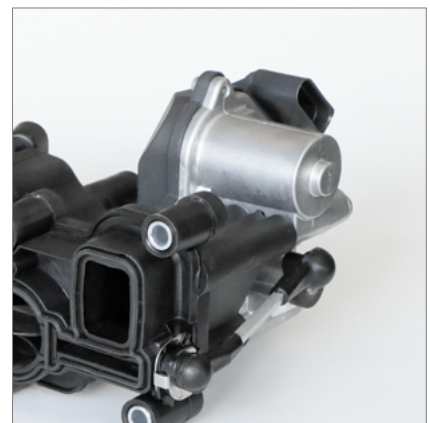
The Motorservice range also includes compatible attachments for specific intake manifolds, for example electric drive modules.