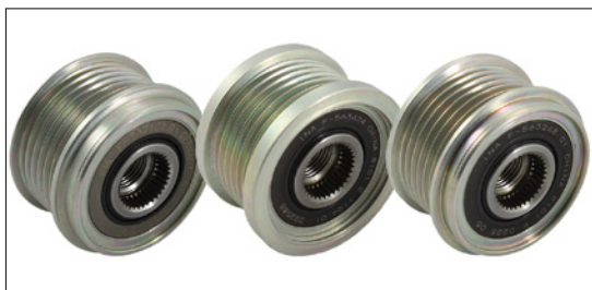
Image 2: Over-running alternator pulleys 535 0063 10 (left), 535 0202 10 (centre), 535 0203 10 (right)

Vibrations and loud noises from the front end accessory drive may be produced in the vehicles listed above with a rigid alternator belt pulley. These vibrations and noises are caused by the rotational irregularities in the diesel engine, which are greater than those in a petrol engine.