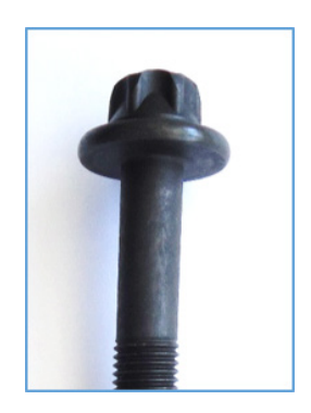
Bolt with flange in its head

In some part numbers, the original manufacturer changes the original design of the bolt , which turns from having a loose washer to include it in the head as a flange. When the flange is included, the length of the bolt stem decreases (measured form under the head to the threaded end), because the thickness of the washer is included.