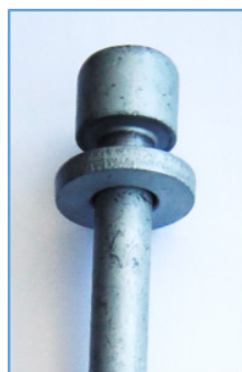
Bolt with washer under the head

On the other hand, some bolts, instead of the washer, include a "flange" together with the head that has the same function