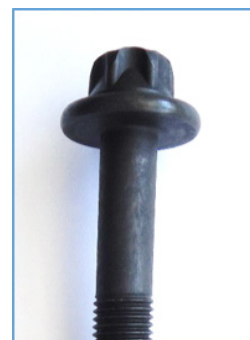
Bolt with flange in its head

In some part numbers, the original manufacturer changes the original design of the bolt , which turns from having a loose washer to include it in the head as a flange . When the flange is included, the length of the bolt stem decreases (measured from under the head to the threaded end), because the thickness of the washer is included.