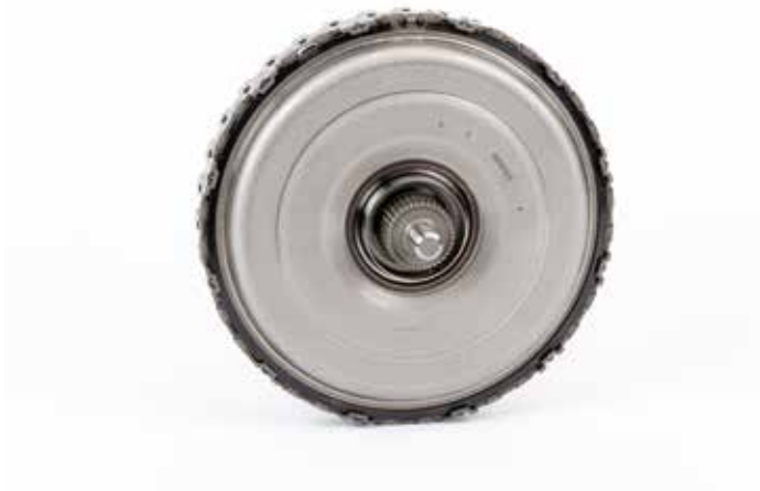
DOUBLE CLUTCH, ENGINE SIDE